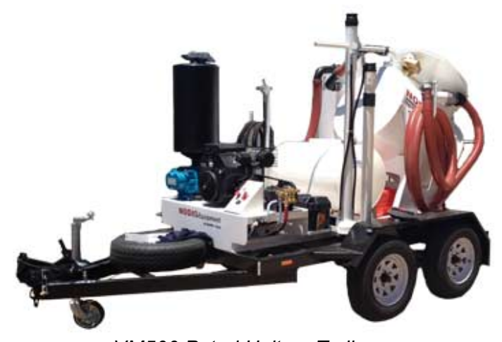
VM500 Petrol Unit on Trailer