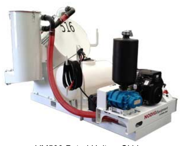
VM500 Petrol Unit on Skid